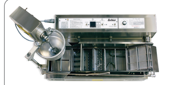
Donut Robot® Mark II - Mark II GP